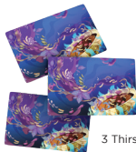
3 Thirst cards